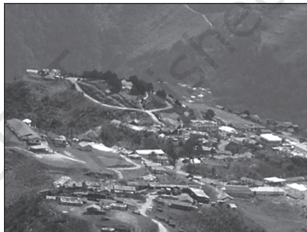
Fig. 4.2 : Semi-clustered settlements

Semi-clustered or fragmented settlements may result from tendency of clustering in a restricted area of dispersed settlement. More often such a pattern may also result from segregation or fragmentation of a large compact village. In this case, one or more sections of the village society choose or is forced to live a little away from the main cluster or village. In such cases, generally, the land-owning and dominant community occupies the central part of the main village, whereas people of lower strata of society and menial workers settle on the outer flanks of the village. Such settlements are widespread in the Gujarat plain and some parts of Rajasthan.