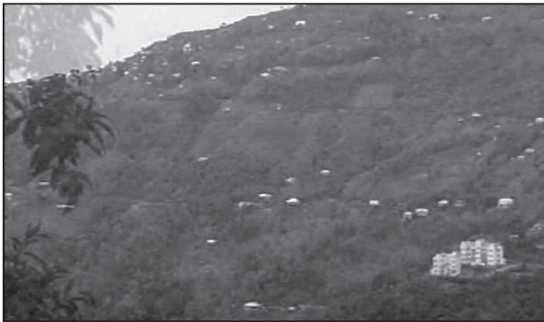
Fig. 4.3 : Dispersed settlements in Nagaland

with farms or pasture on the slopes. Extreme dispersion of settlement is often caused by extremely fragmented nature of the terrain and land resource base of habitable areas. Many areas of Meghalaya, Uttarakhand, Himachal Pradesh and Kerala have this type of settlement.