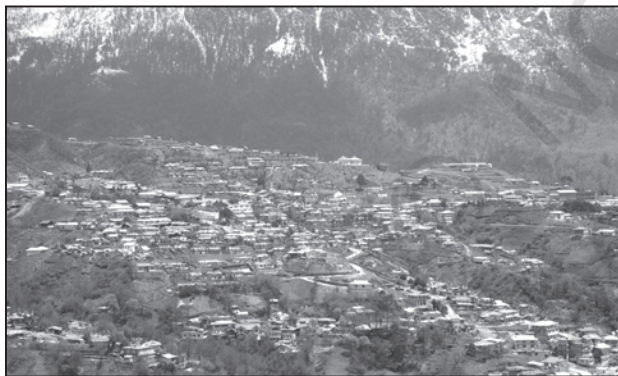
Fig. 4.1 : Clustered Settlements in the North-eastern states

The clustered rural settlement is a compact or closely built up area of houses. In this type of village the general living area is distinct and separated from the surrounding farms, barns and pastures. The closely built-up area and its