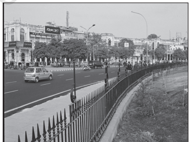
Fig. 4.4 : A view of the modern city

The British and other Europeans have developed a number of towns in India. Starting their foothold on coastal locations, they first developed some trading ports such as Surat, Daman, Goa, Pondicherry, etc. The British later consolidated their hold around three principal nodes – Mumbai (Bombay), Chennai (Madras), and Kolkata (Calcutta) – and built them in the British style. Rapidly